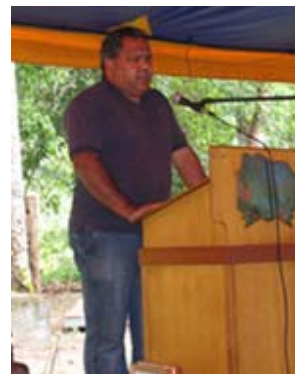
Noel Pearson, Director of Cape York Institute said there was a "gathering momentum of denialism in this country" and that "local history about real people and real events is imperative" to debunk myths presented as fact.