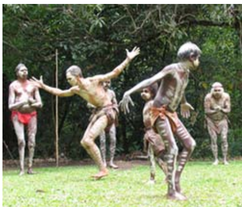
Kuku Yalanji dancers opened the proceedings with a special welcome dance.